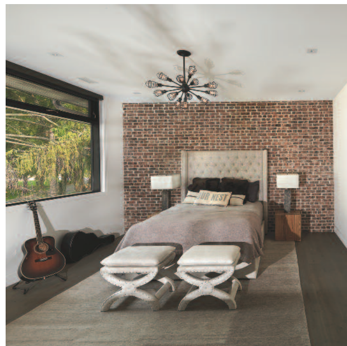
Above: The master bathroom. Beside that: The two storey high entrance, with Giorgetti furniture. Right: The cantilevered stairs, anchored to the wall with a heavy duty steel construction. The walls are clad in Élitis wall coverings. Left: One of the children's bedrooms.

purple rug in the dining area gave drama and great contrast. The wooden panel above the kitchen island is now the big focal point in this open area providing weight and elegance, and at the same time warmth in the space.” “The daCosta, a family of seven (parents and five kids), truly enjoy gathering around the island for family dining. The bedrooms upstairs were designed in the same style with enlarged windows. In order not to compete with the beautiful views the designers came up with a selection of simple furniture and natural colors.” “Working with the daCosta family was truly one of the most inspirational events in my career. Karen, Steve, and their five children all have strong individual characters and they