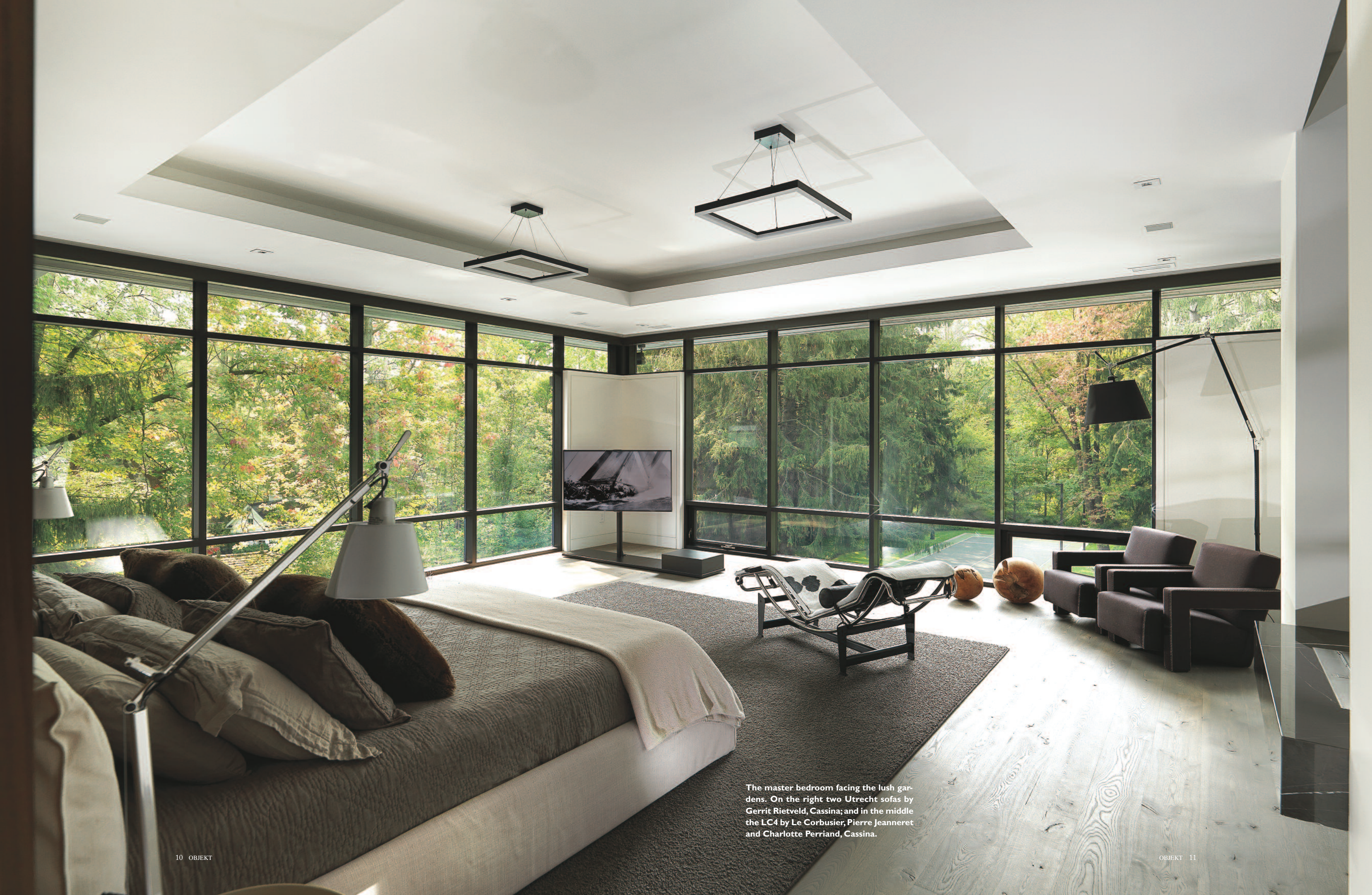
The master bedroom facing the lush gardens. On the right two Utrecht sofas by Gerrit Rietveld, Cassina; and in the middle the LC4 by Le Corbusier, Pierre Jeanneret and Charlotte Perriand, Cassina.